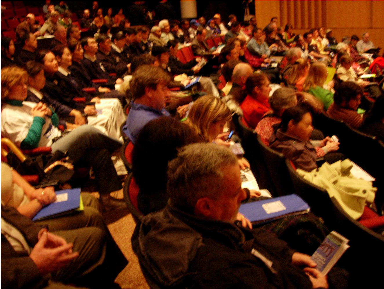
Another audience view