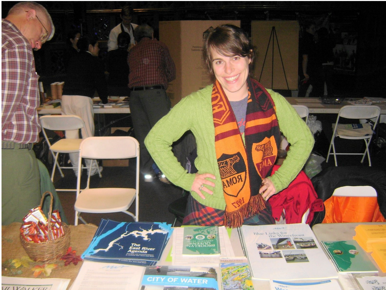
Metropolitan Waterfront Alliance