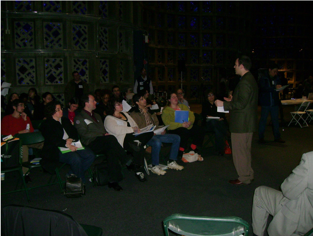
One of several workshops