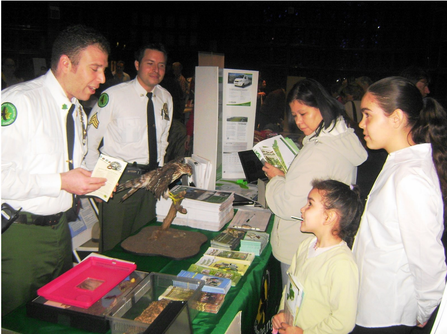
Urban Parks Ranger