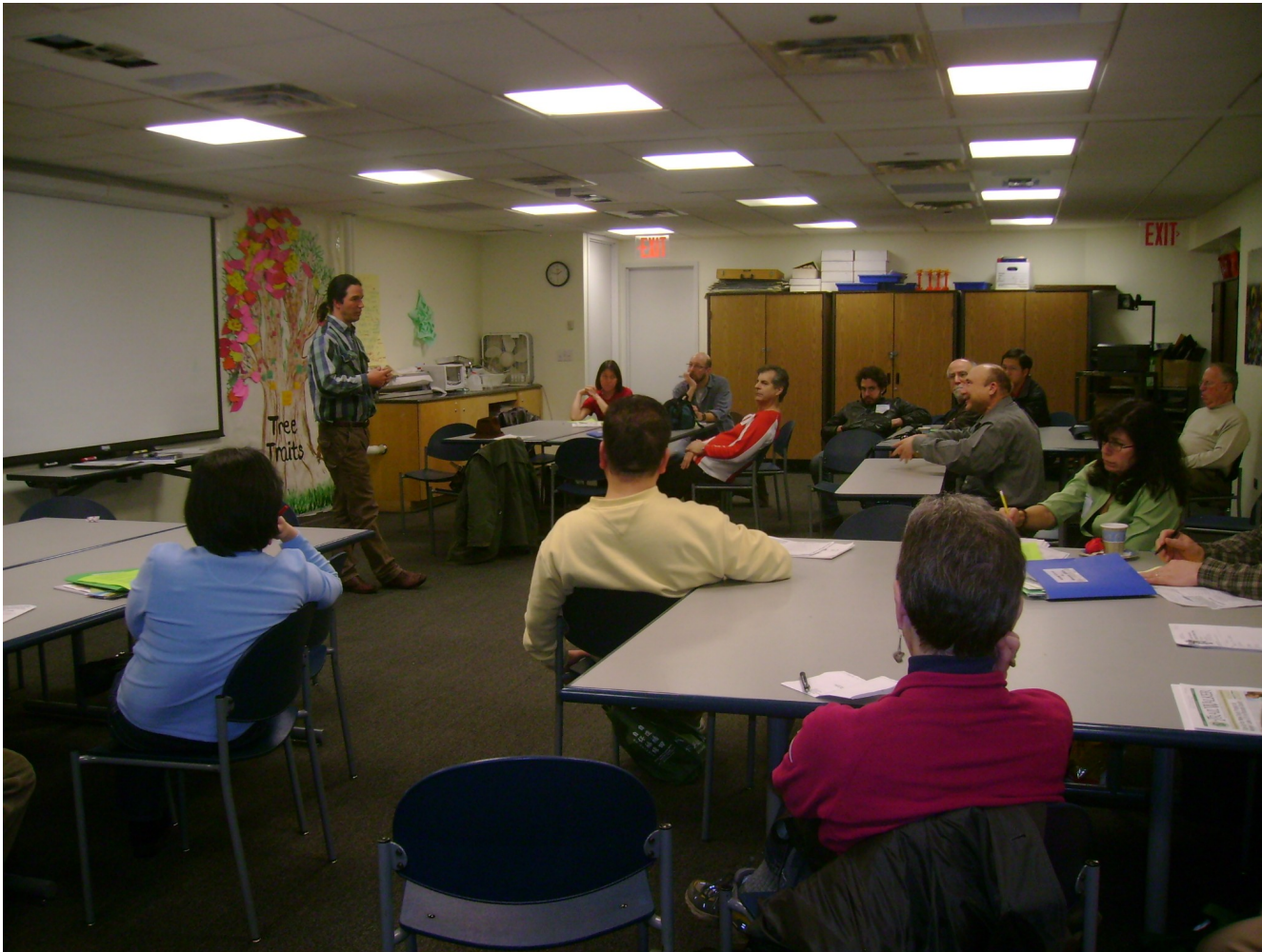
Another Workshop.