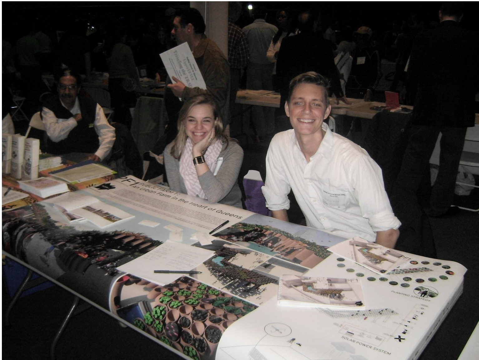
Public Farm 1