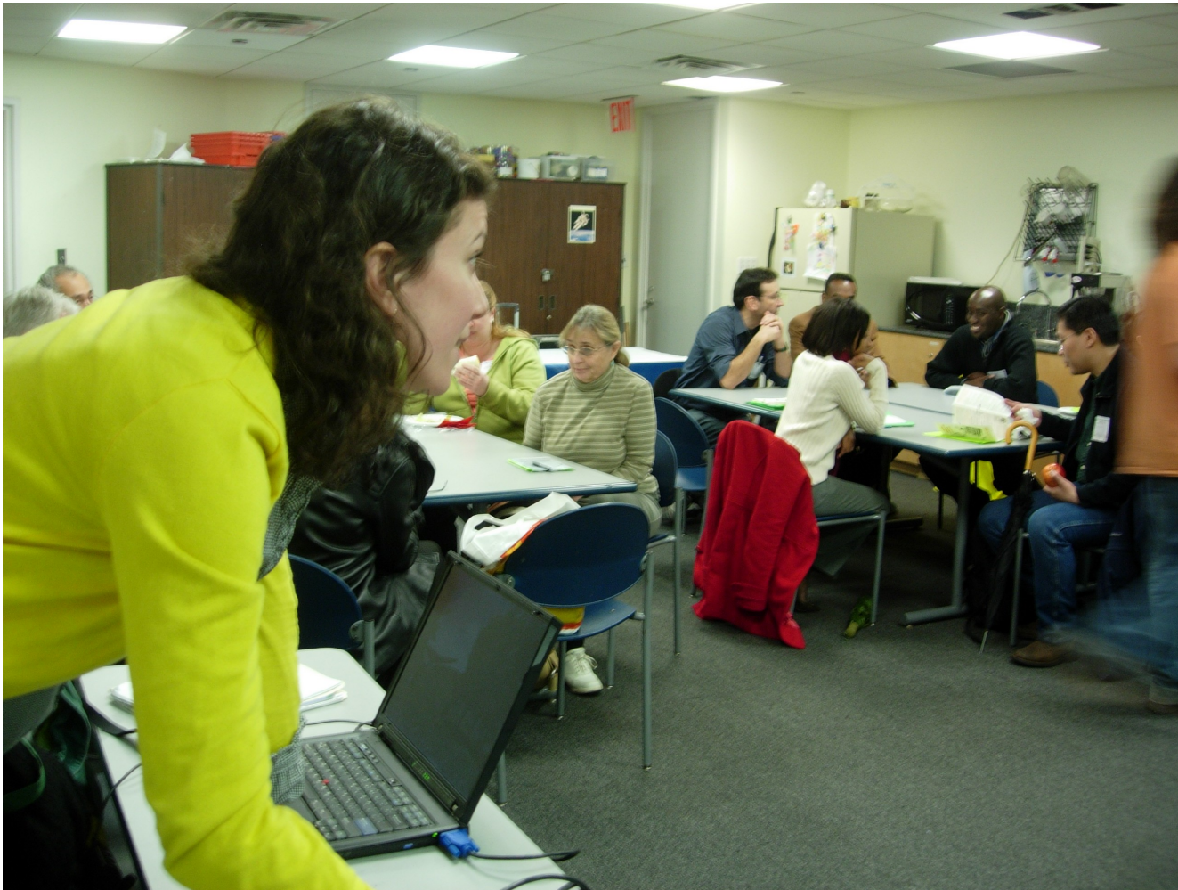
Another Workshop