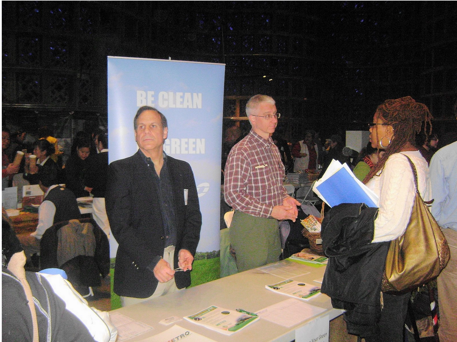
Sponsor Metro Your Green Energy Source's table