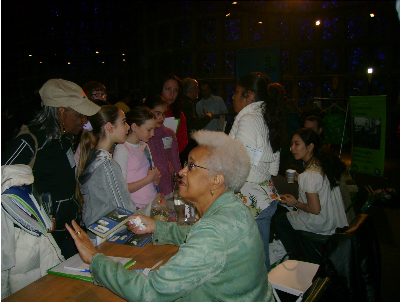
One of the many tables in the Great Hall,. The tabling exhibition highlighted local and city wide volunteer, non-profit, and green organizations such as our sponsors, City Parks Foundation, Citizens Committee for NYC, Solar One. Transportation Alternatives Queens Committee along with 2 dozen other organizations.