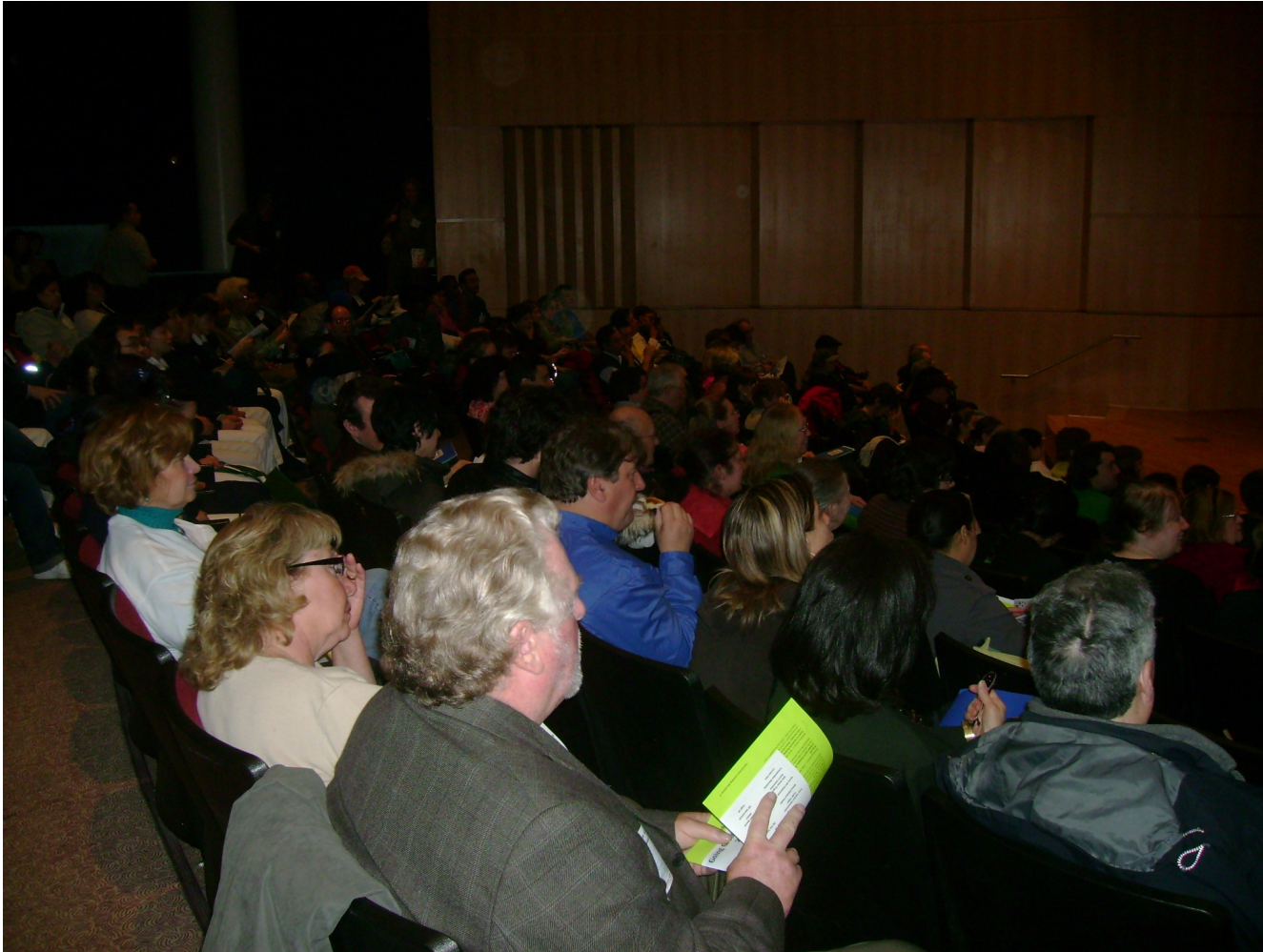
Some of the packed audience at the morning opening ceremony and keynote address