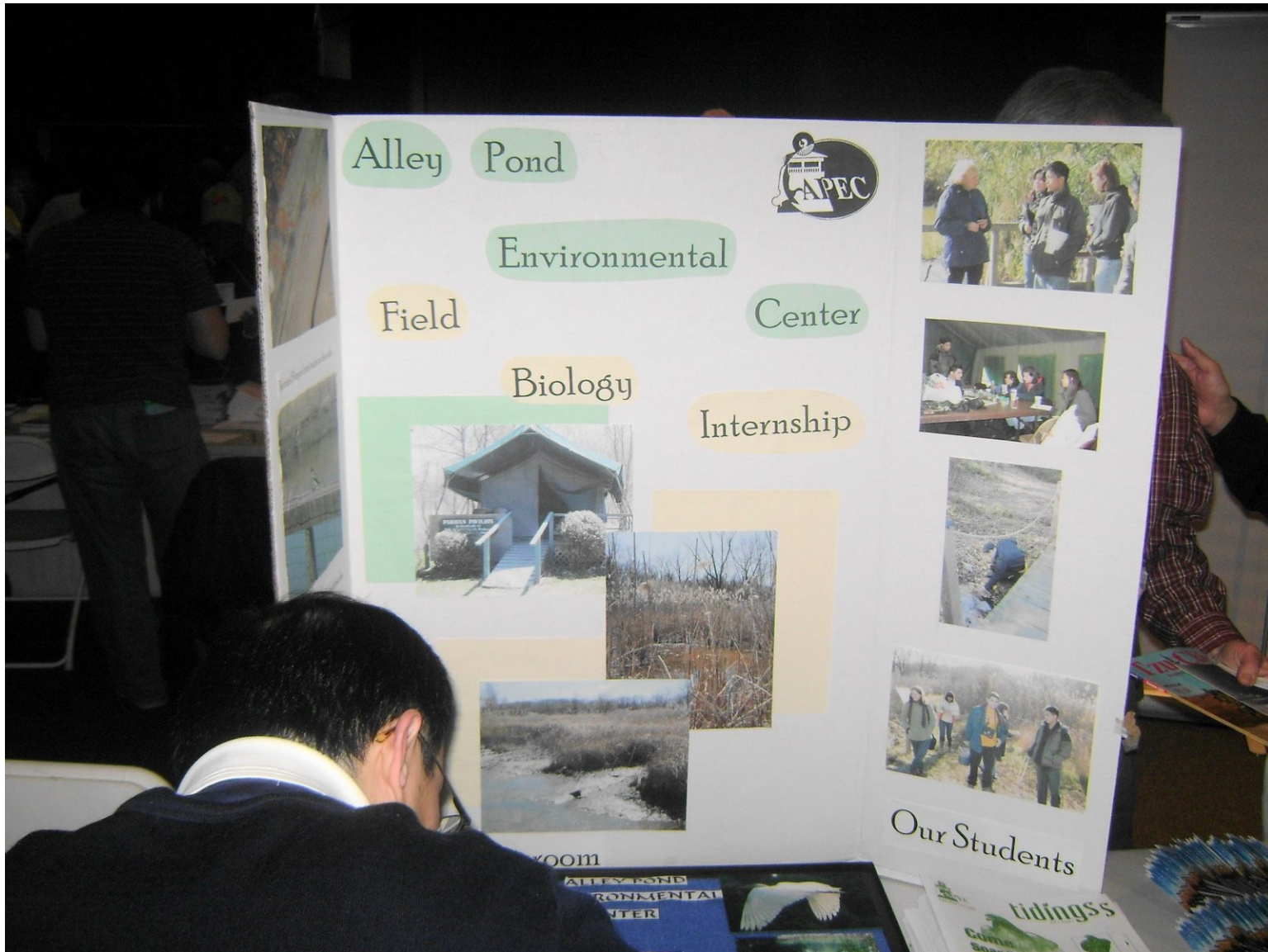
Alley Pond Environmental Center