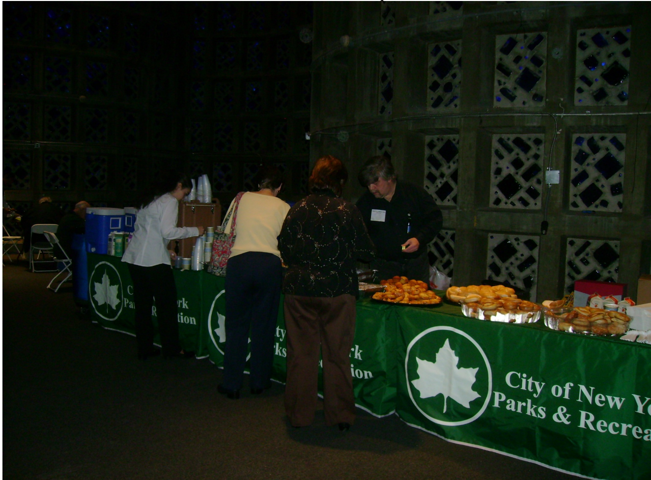
Participants sample the sumptuous breakfast in the Great Hall courtesy of HSBC and Metro Your Green Energy Source. Both sponsors hosted our lunch of sandwiches and wraps followed by cookies and pastries.