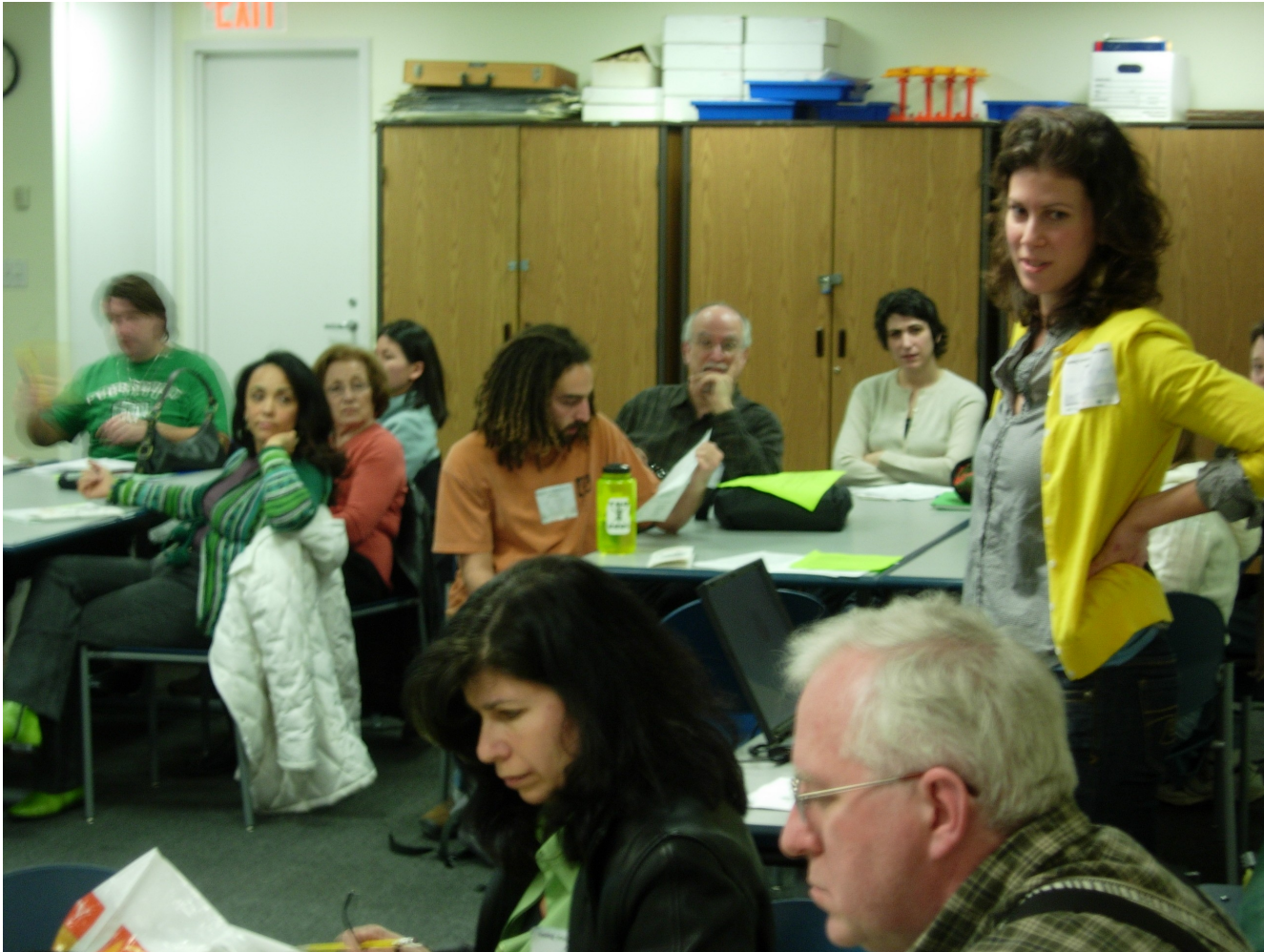
Another Workshop