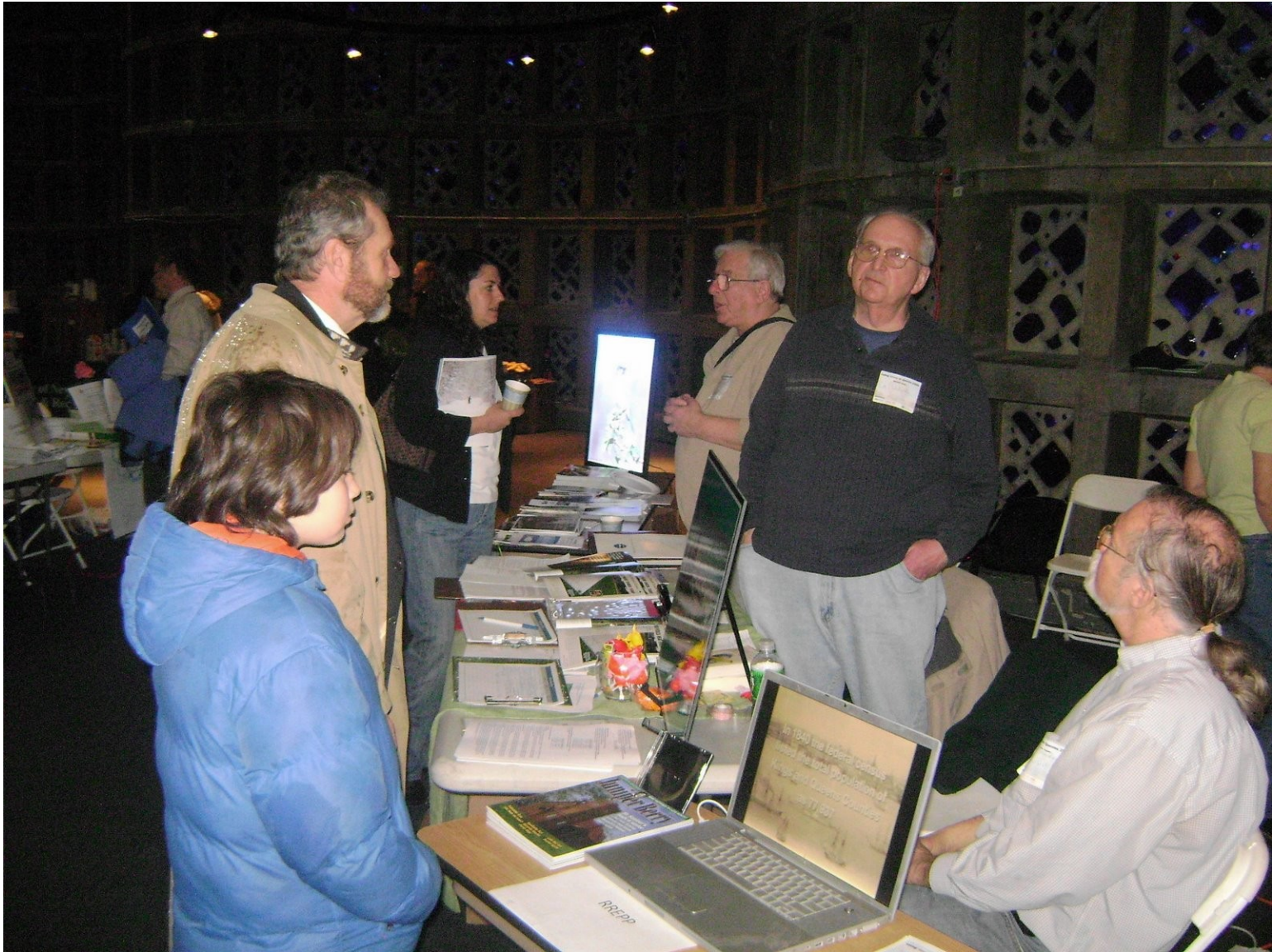
Ridgewood Reservoir Education and Preservation Project