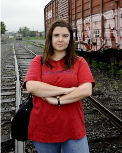
Pokress for News

At least 65 tractor-trailers loaded with garbage could rumble into Maspeth every day under a new waste removal plan proposed to start in 2011.