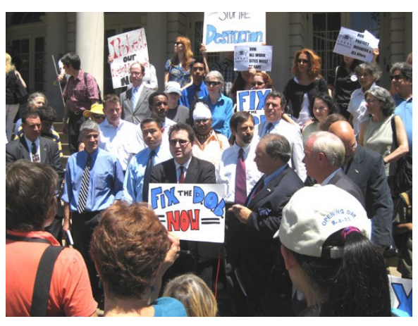
Below, Our simple message:

Note the diverse grassroots participation and support for Citizens for Building Department Reform.