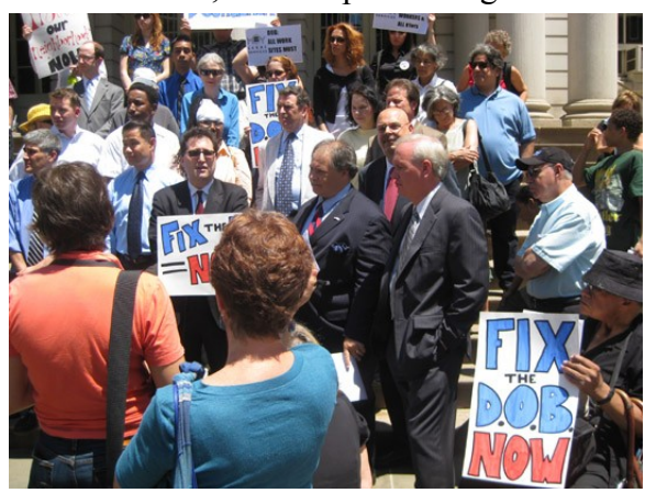
Fix DOB now!

Editors, please credit Photos by Historic Districts Council. Thank you to HDC for these photographs.